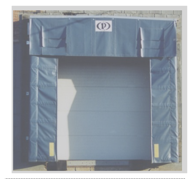
SALES & SERVICE BY: